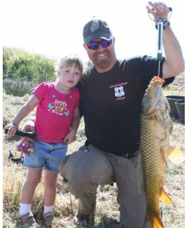
At last year's event, 79 participants caught 138 carp to help with the study.

Everyone is invited to join us to experience the past with docent-lead tours, educational activities, archaeological excavation demonstrations and a variety of other demonstrations at the 1880s Historic Sod House Ranch near Refuge headquarters.